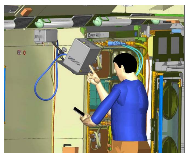
Figure. 3. Mochii topology in the Japanese Experiment Module within ISS. 95<sup>th</sup> Percentile male user shown operating Mochii with ISS-supplied iPad tablet. Mochii will be powered by 120VAC inverter and connected to station Ethernet and Wifi.