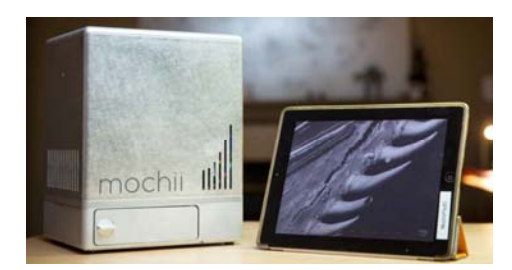
Figure 1. Voxa's Mochii<sup>TM</sup> Electron Microscope (left) with iPad controller (right) with high resolution image of the head of a wheat plant.